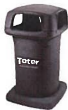
Custom Graphics Available