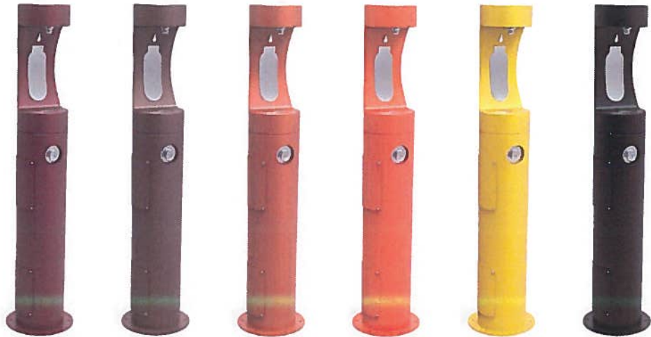
Purple PUR Brown BRN Terracotta TER Orange ORN Yellow YLW Black BLK

Information on hand dryers and commercial restroom accessories