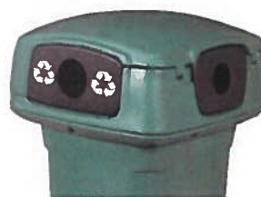
Can/Bottle Recycling Door Inserts (inserts sold in packs of four)

Extreme Purpose • Extreme Toughness • Extreme Wear