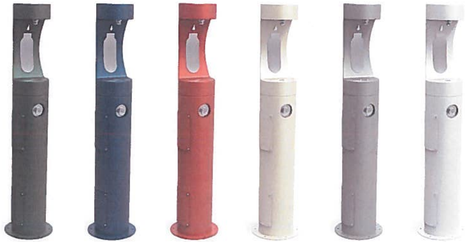
Evergreen EVG Blue BLU Red RED Beige BGE Gray GRY White WHT